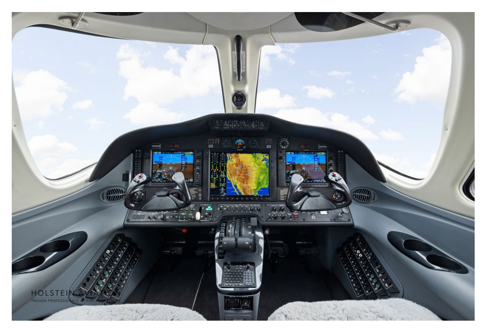
Specifications subject to verification upon inspection. Aircraft subject to prior sale without notice.