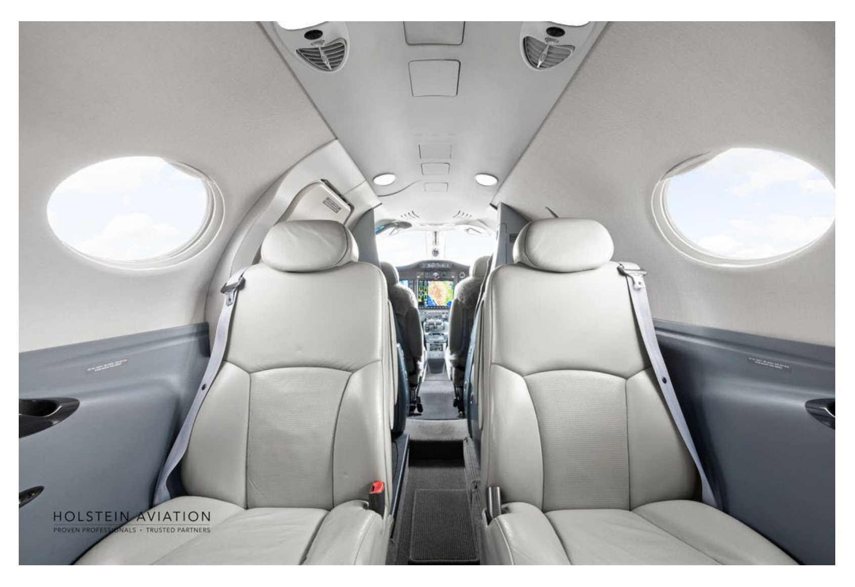
Specifications subject to verification upon inspection. Aircraft subject to prior sale without notice.