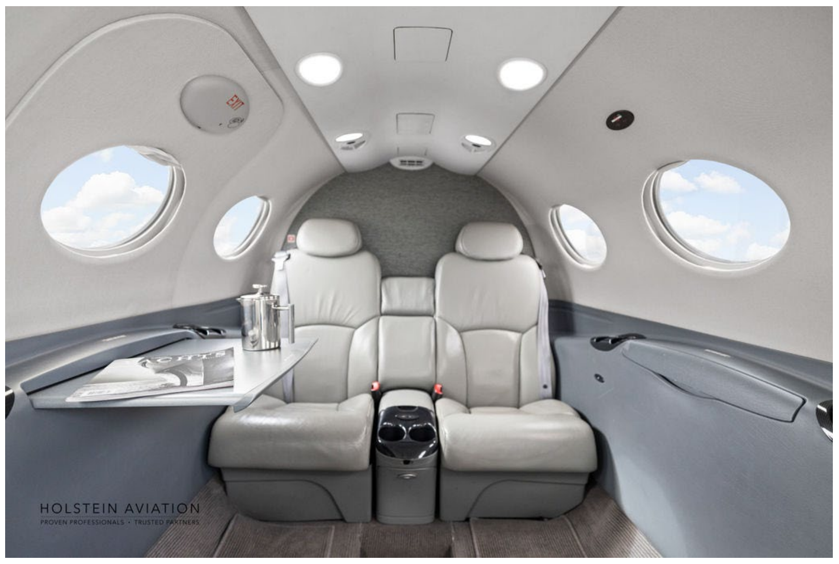
Specifications subject to verification upon inspection. Aircraft subject to prior sale without notice.