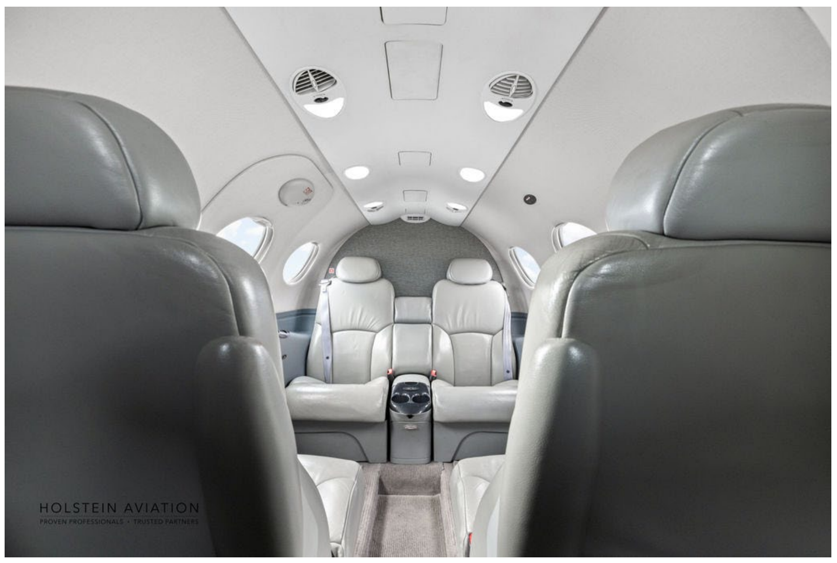
Specifications subject to verification upon inspection. Aircraft subject to prior sale without notice.